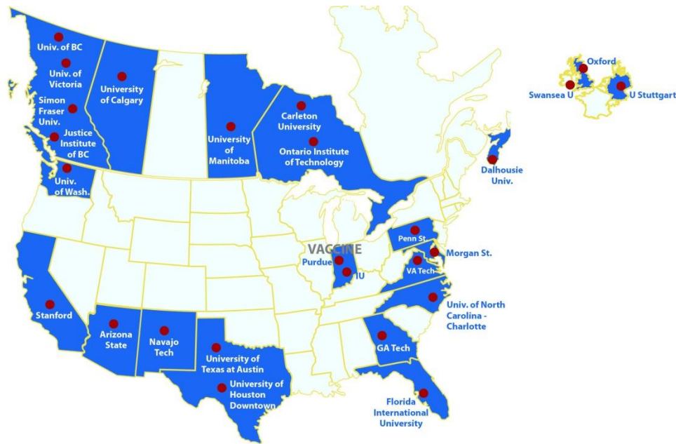
Figure 2: VACCINE International Team Members and Partners